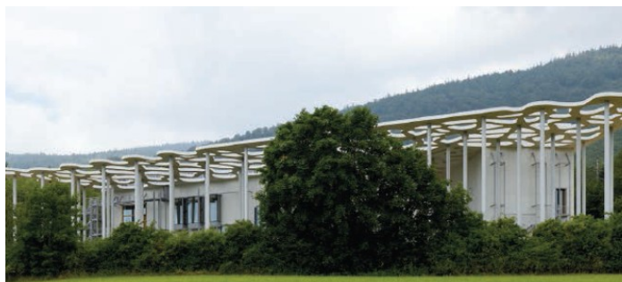
Fondation Jan Michalski