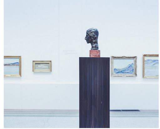
Private Visit to Musée Rath Hodler Exhibit, May 19