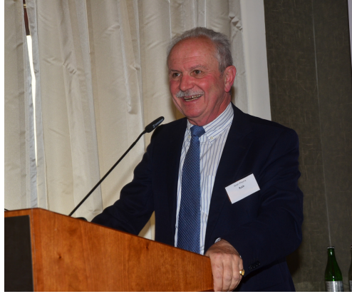
Ex-President of the SNP Provides Financial Insights, May 3