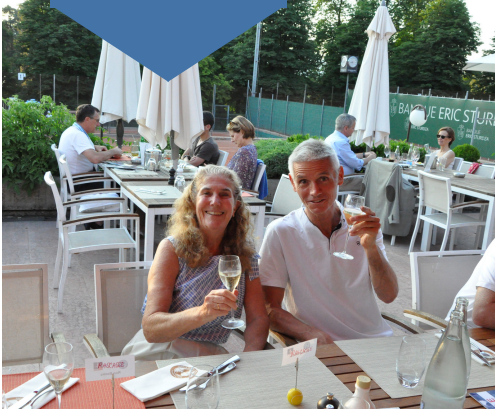
Annual AIC Tennis Tournament July 8